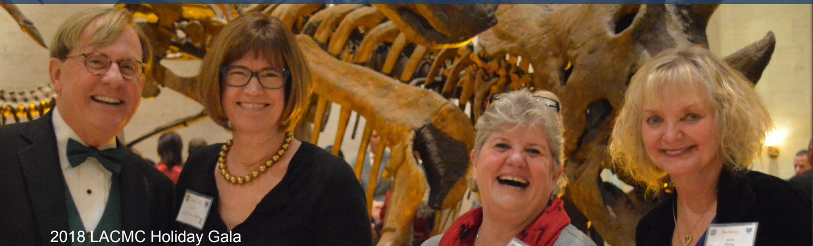
2018 LACMC Holiday Gala